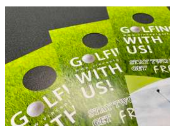
Door Hangers and Hang Tags