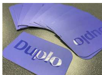
Die Cut Business Cards