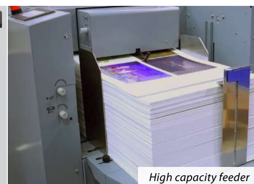
High capacity feeder