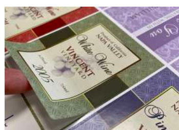
Stickers and Labels