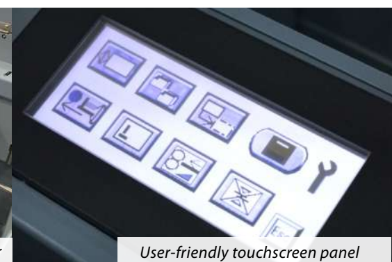
User-friendly touchscreen panel