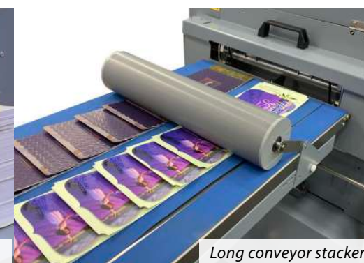
Long conveyor stacker